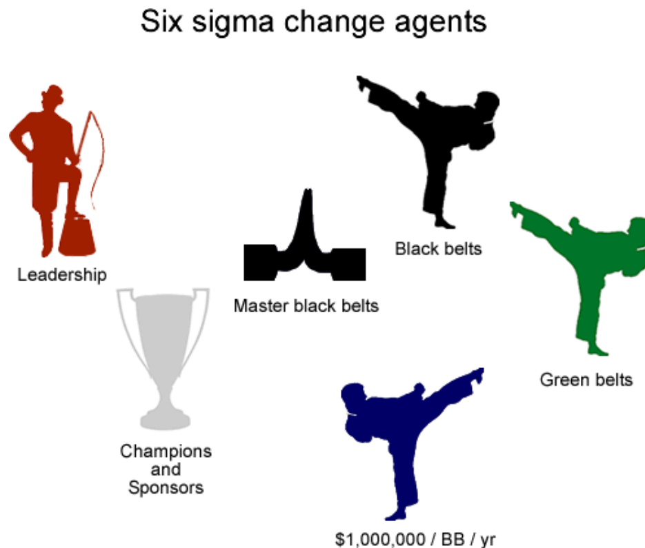
Figure 2: Six Sigma Infrastructure

A very powerful feature of Six Sigma is the creation of an infrastructure to assure that performance improvement activities have the necessary resources. In this Author's opinion, failure to provide this infrastructure is the #1 reason why 80% of all TQM implementations failed in the past. Six Sigma makes improvement and change, the full-time job of a small but critical percentage of the organization's personnel. These full time change agents are the catalyst that institutionalizes change. Figure 2 illustrates the required human resource commitment required by Six Sigma.